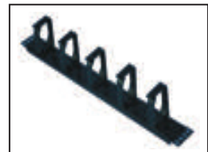
1U cable manager