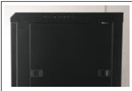
Standard side panel