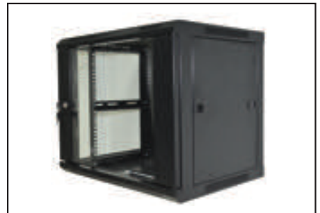
Optional front door