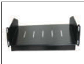
1U cantilever shelf