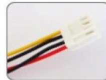
4Pin for FDD