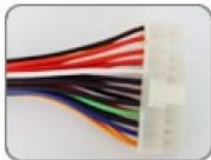
20+4P for M/B