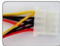
4Pin for HDD